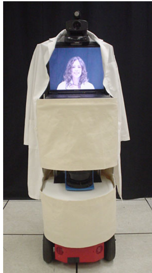
Fig. 1. An image of Clara

Clara is constructed from standard off-the-shelf components. Mobility and primary battery power are provided by an ActivMedia Pioneer 2 DX mobile robot platform. A 1GHz Pentium III computer running Gentoo Linux resides inside, controlling the motors and providing basic I/O support. Sensors on the robot include a laser range-finder, a camera, and a microphone. The laser, a SICK LMS200, provides a 180° field of view used for obstacle avoidance and localization; it is mounted so as to be able to detect the feet of hospital beds. The vision system consists of a Sony EVI-D30 pan-tilt-zoom camera with a 640 × 480 frame-grabber. The produced video signal is fed through to an ACTS color-tracking server, which provides color blob detection. Acoustic perception is generated with a Shure 503BG unidirectional dynamic microphone designed for computer voice recognition. The