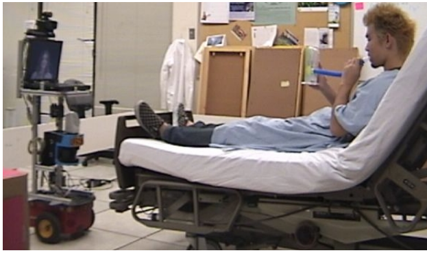
Fig. 4. Clara (without covers) assisting a patient with the spirometry exercise

the use of verbal games, sounds, and robot movement. Furthermore, alterations to the physical appearance of the robot will be investigated as an additional path toward patient motivation and engagement.